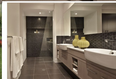
Seabreeze D6 Trend Facade Illustrated