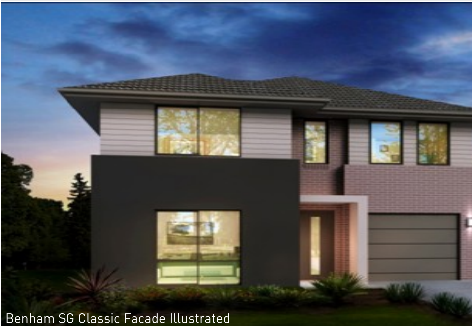
Benham SG Classic Facade Illustrated