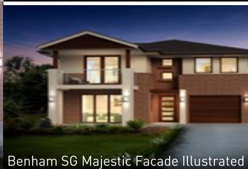
Benham SG Majestic Facade Illustrated