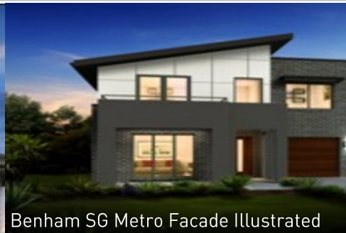
Benham SG Metro Facade Illustrated