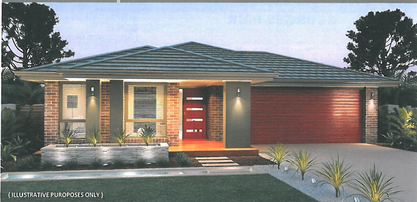
( ILLUSTRATIVE PUROPOSES ONLY )