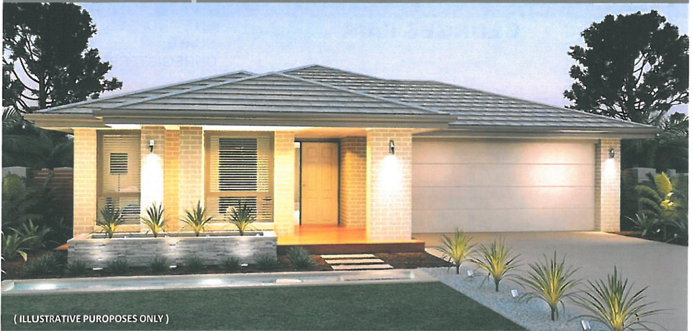
( ILLUSTRATIVE PUROPOSES ONLY )