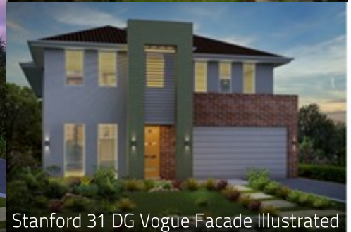
Stanford 31 DG Vogue Facade Illustrated