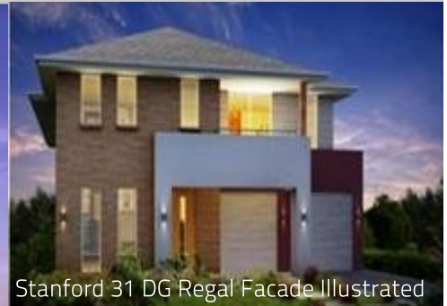
Stanford 31 DG Regal Facade Illustrated