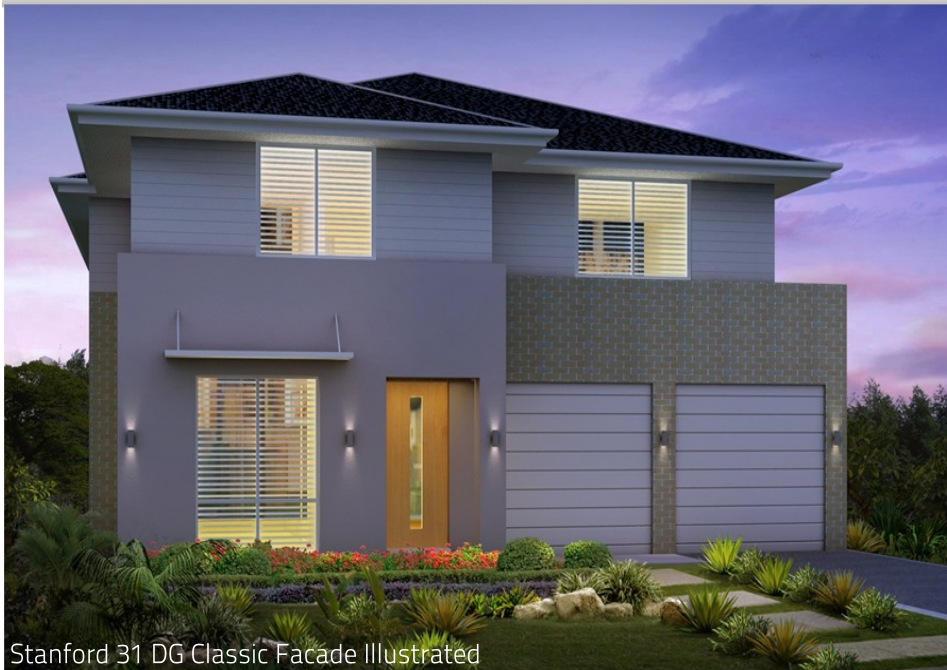
Stanford 31 DG Classic Facade Illustrated