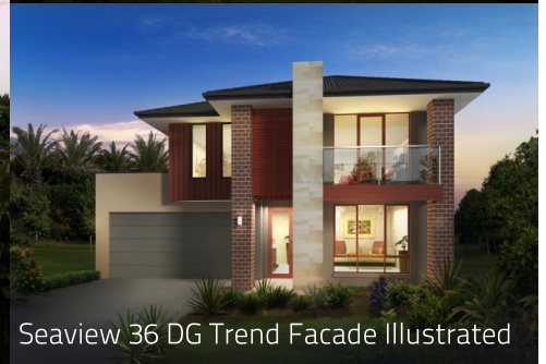
Seaview 36 DG Trend Facade Illustrated