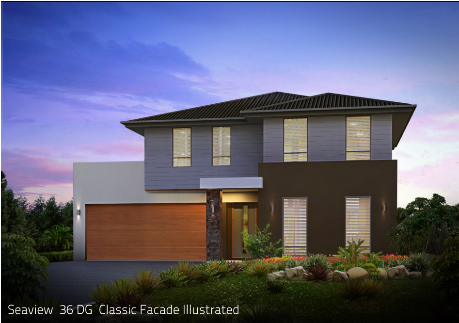
Seaview 36 DG Classic Facade Illustrated