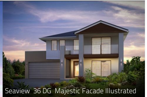
Seaview 36 DG Majestic Facade Illustrated