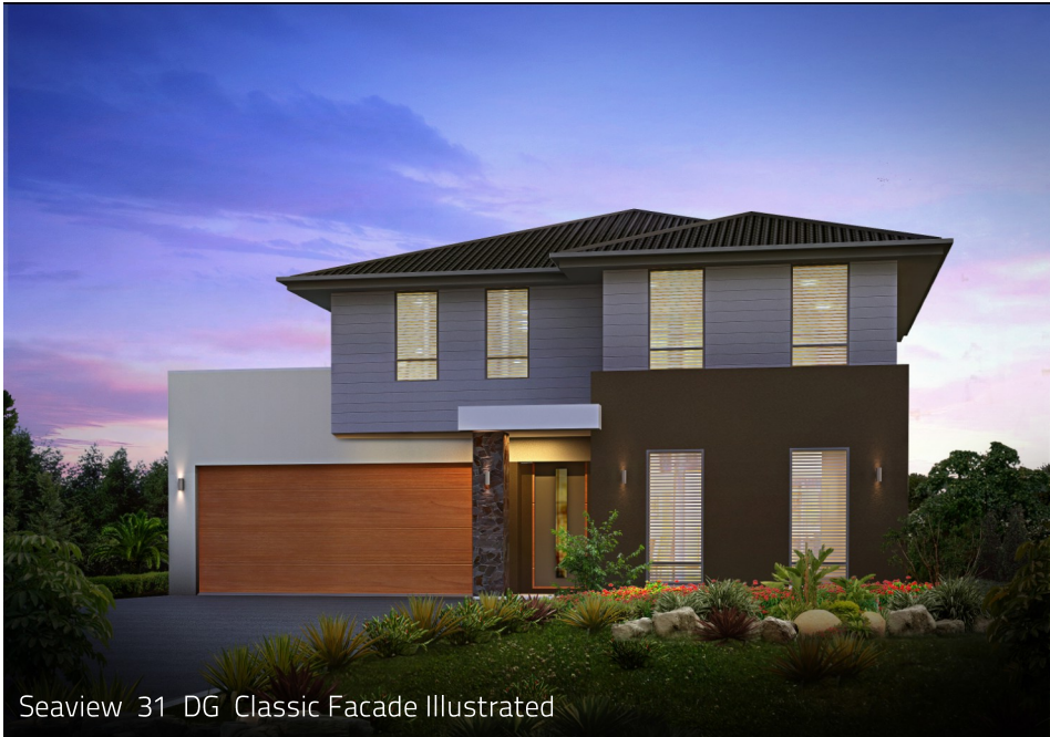
Seaview 31 DG Classic Facade Illustrated