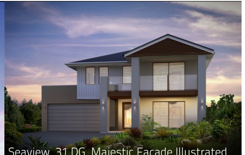
Seaview 31 DG Majestic Facade Illustrated