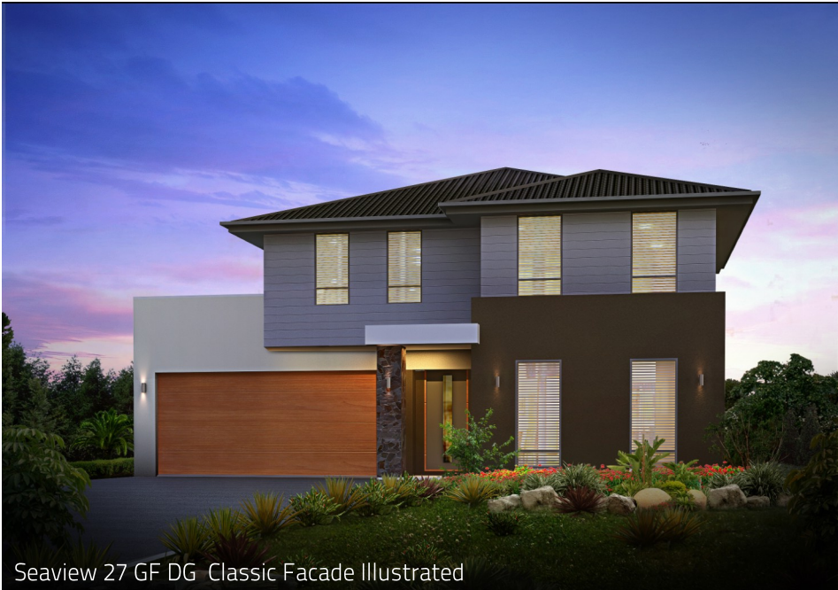
Seaview 27 GF DG Classic Facade Illustrated