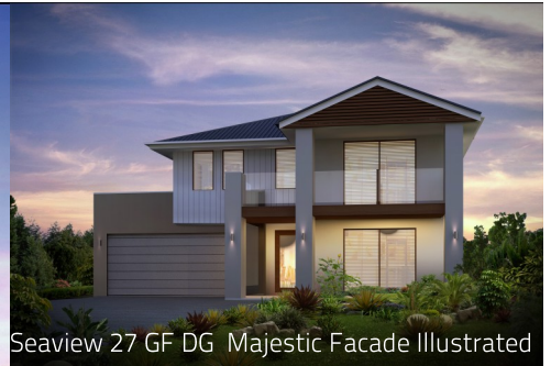
Seaview 27 GF DG Majestic Facade Illustrated