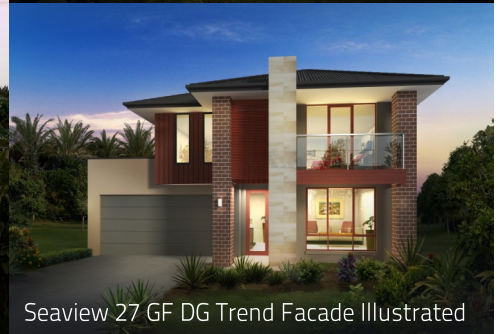
Seaview 27 GF DG Trend Facade Illustrated