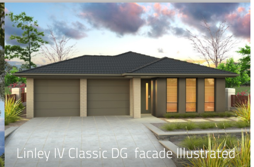
Linley IV Classic DG facade Illustrated