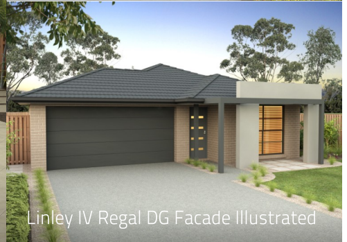
Linley IV Regal DG Facade Illustrated