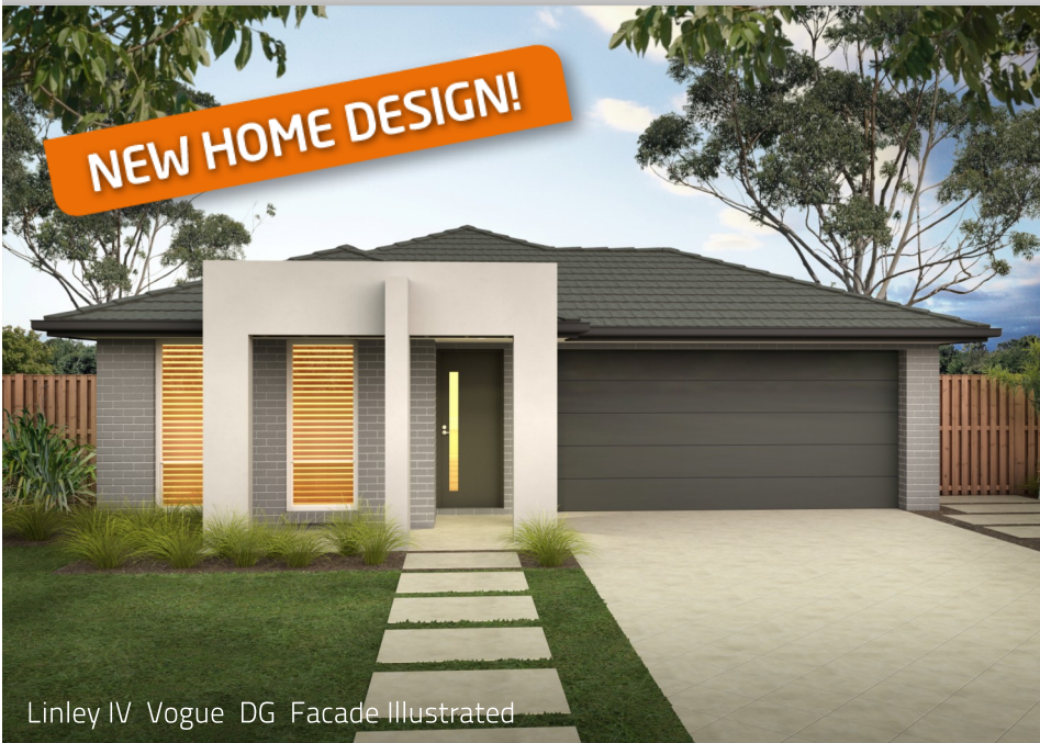
Linley IV Vogue DG Facade Illustrated