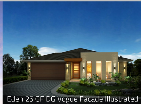
Eden 25 GF DG Vogue Facade Illustrated