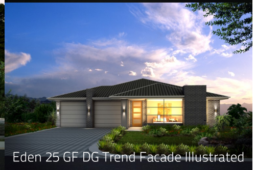
Eden 25 GF DG Trend Facade Illustrated