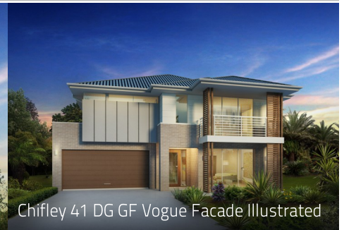
Chifley 41 DG GF Vogue Facade Illustrated