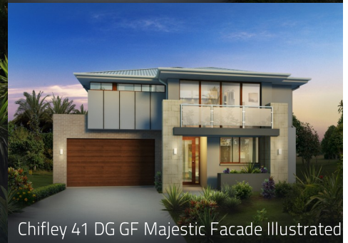
Chifley 41 DG GF Majestic Facade Illustrated