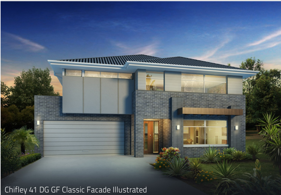
Chifley 41 DG GF Classic Facade Illustrated