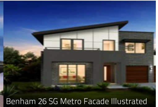
Benham 26 SG Metro Facade Illustrated