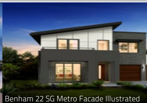
Benham 22 SG Metro Facade Illustrated