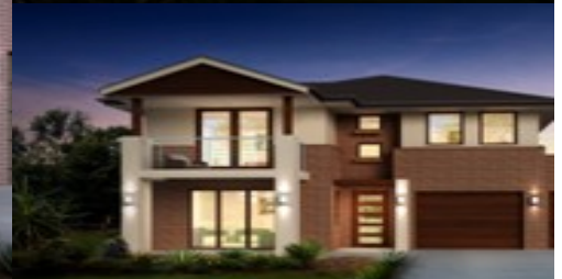
Benham 21 SG Majestic Facade Illustrated