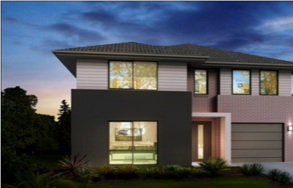
Benham 21 SG Classic Facade Illustrated