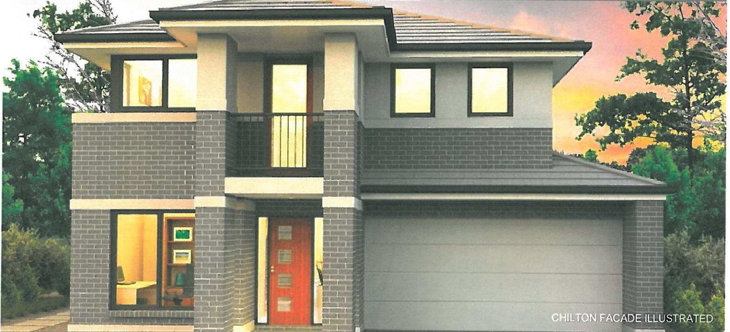
CHILTON FACADE ILLUSTRATED

ALKA GARDENS ESTATE LOT 07 ASTON CLOSE HOXTON PARK