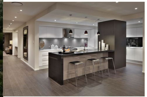
KEMPSEY CLASSIC WITH DOUBLE GARAGE ILLUSTRATED.